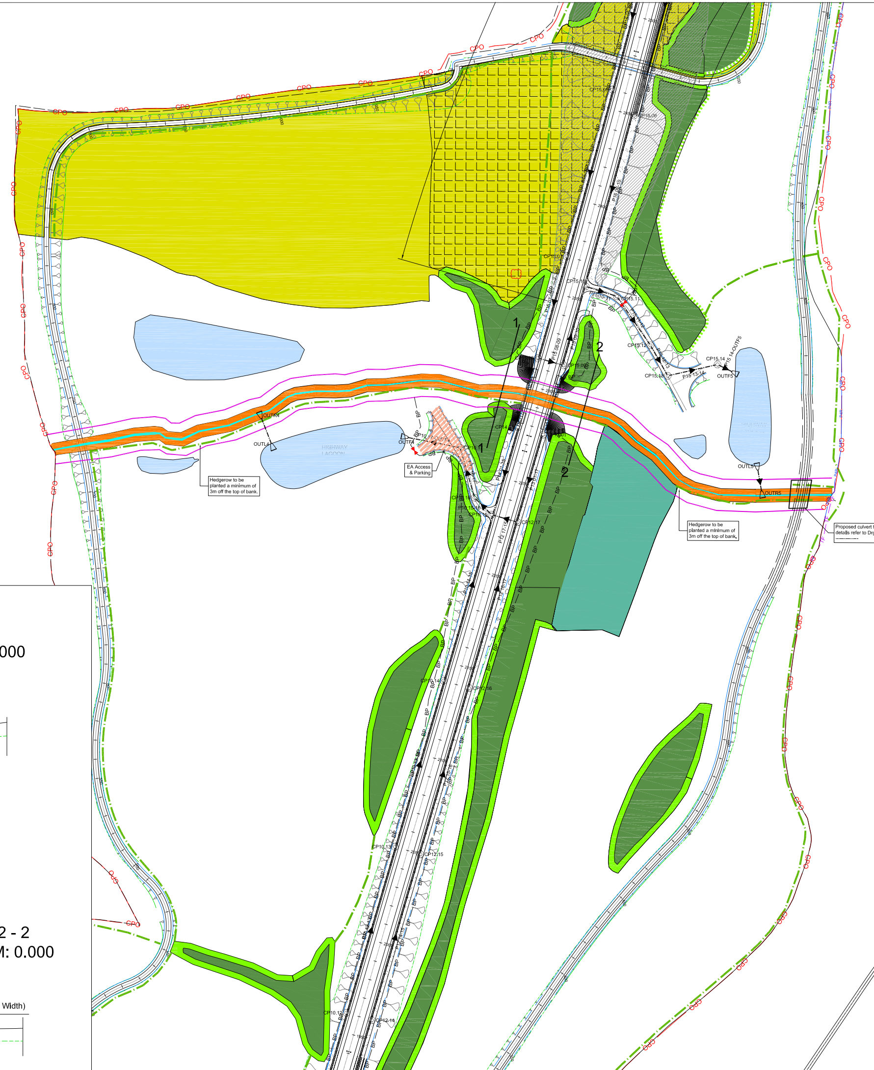
Combe Haven Cross Section 1 - 1 SCALE: H 1:500, V 1:500. DATUM: 0.000